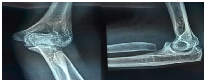
[Table/Fig-3]: Antero-posterior and lateral radiographs of the right elbow at postoperative week six after radial head excision.

Reviews were done at weeks 3, 6 and 24. Slab removal and rehabilitation of elbow was started on week three. X-rays were done on all reviews [Table/Fig-3,4]. Range of motion and elbow function was assessed and scored as per the Disabilities of the Arm, Shoulder