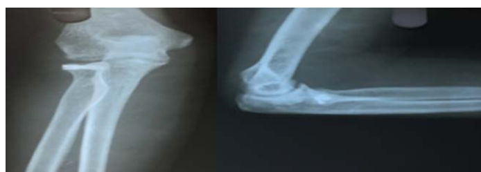
[Table/Fig-4]: Antero-posterior and lateral radiographs of the left elbow at postoperative week six after radial head open reduction and internal fixation with mini screws.

and Hand (DASH) scoring system [14] during all the reviews. The results were tabulated, compared and analysed statistically using the 'chi-square test'. The 'p<0.05' was considered significant.